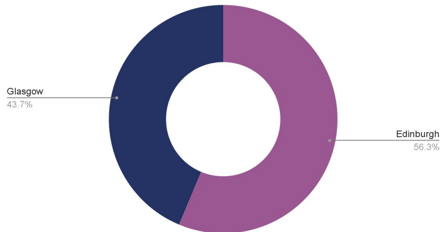
2017 Market Share

654,987 DIRECT PASSENGERS BETWEEN THE USA AND SCOTLAND